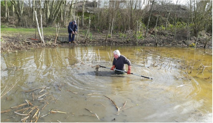
The gang at work.

If you can help either by donation or work please contact Dave Corfield 01704 840705.